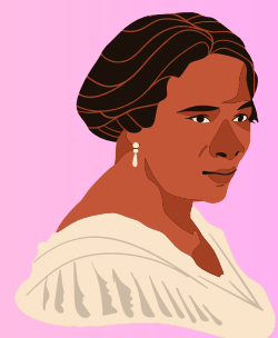
Madam CJ Walker